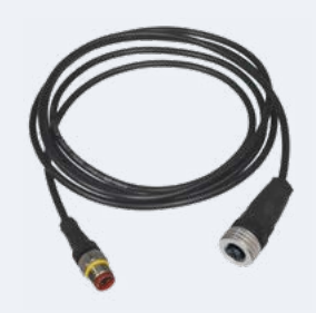
Microscope Extension Cable