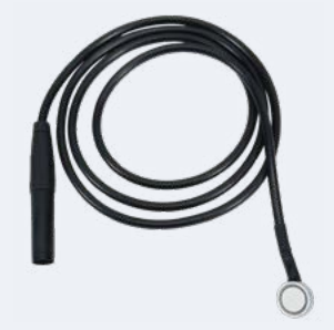
Extended Magnet Cable